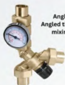
AngleMix™, Angled thermostatic mixing valve